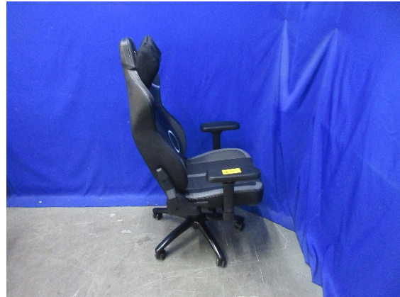
Sample as received - View 2