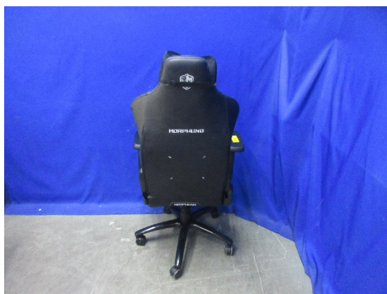
Sample as received - View 3