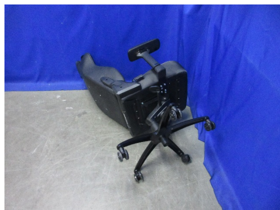
Sample as received - View 4

SGS authenticate the photo on original report only